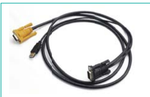
Description: 1.8M USB KVM signal cable Model: CH-1803H